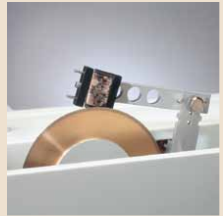
11-2484 Glass Slide Chuck holds petrographic samples for resectioning