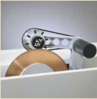
The 11-2181 Rotating/Oscillating Chuck Accessory is available for sectioning difficult materials.