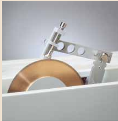
The 11-2482 Fastener Chuck makes longitudinal bolt sections easy.