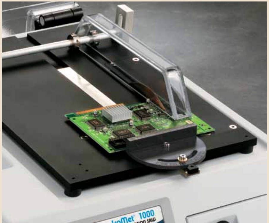
The 11-2182 Table Saw Attachment effectively sections or trims printed circuit boards or larger samples.