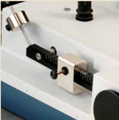
Weight arm and micrometer controls are conveniently located outside the cutting compartment.