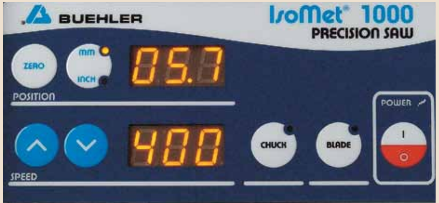
Membran touch-pad control panel and LED display allow operators to quickly set cutting parameters.