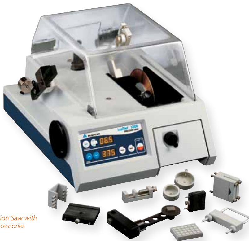
IsoMet® 1000 Precision Saw with optional fixturing accessories

The first step to quality sample preparation is selecting the proper cutting method, one that will not introduce structural damage or defects to the area under analysis. The IsoMet® 1000 Precision Saw was designed for today's material analyst who demands sample integrity and rapid sectioning capabilities. This saw quickly sections a broad range of materials including: